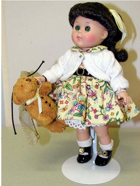
Ginny with her very own Fire-Fly Teddy Bear by Merry Thought was but one of the souvenir dolls. She dressed appropriately in a tagged Vogue garden patterned outfit with a sweater just in case it got too cool.