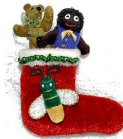
The World of Miniature Bears created a Christmas Stocking adorned with a Fire-Fly and stuffed with a Teddy Bear and a Golly.