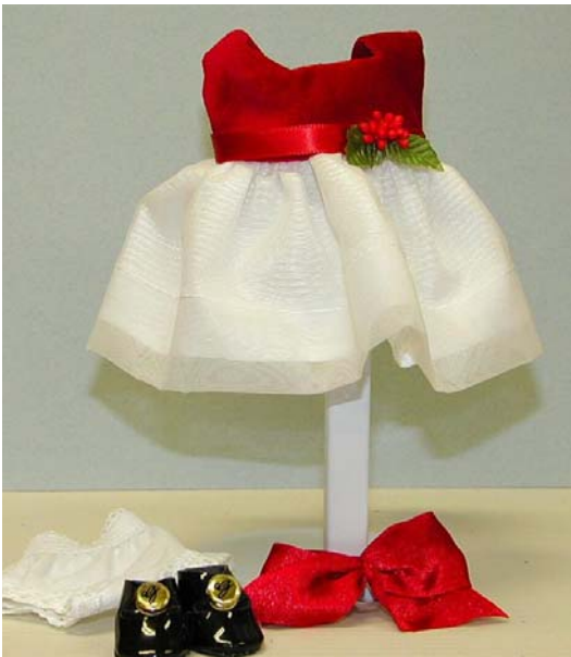
On Christmas Morning she dresses up in her tagged Vogue Christmas Party outfit to see what Santa Claus brought her.