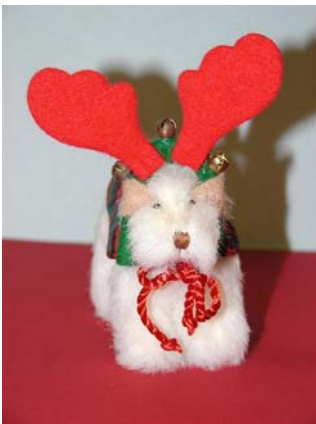
Then Ginny goes to Church and later that day Ginny and Sparky go out to visit friends. Ginny puts on her tagged Vogue warm coat, hat, muff, and her pretty new boots. Sparky wears his reindeer antlers just for fun.