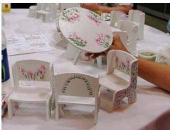
From plain white to spectacular!

Looks of astonishment were observed on the faces of attendees when they were presented with TWO more Vogue Ginny dolls. These were the awaited Tea Party Guests for which Ginny had cleaned the Doll House. The doll in the yellow tagged Vogue outfit has medium length dark brown hair. Her outfit consists of a dress of pleated crepe material with full skirt and wide ruffle around the neck. The stunning bonnet of matching material is trimmed with three yellow roses. White panties, white socks, and yellow center snap shoe complete the outfit. Her hair is a medium length dark brown. The blue tagged Vogue dress is of a crisp silky skirt with ruffled sleeve bodice over an attached satin slip and bloomer style panties of the same fabric. The "garland" flower hat ties under the chin with a delicate ribbon. White sock and blue center snap shoes complete her costume.