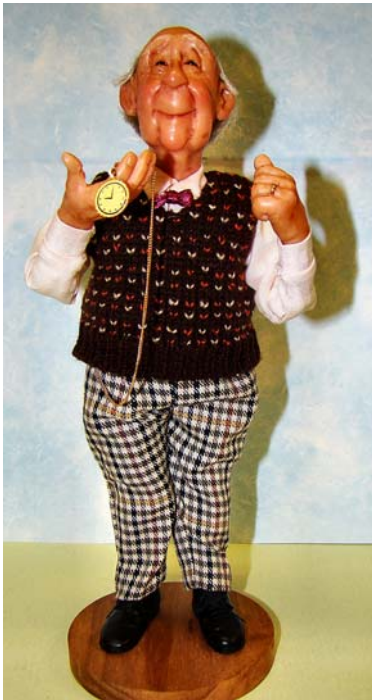
"Mr. Norman" from the Richard Simmons "Nana's Family" collection played the role of the Music Teacher at Fire-Flies Elementary School. He is dressed in a brown knit sweater and plaid pants.