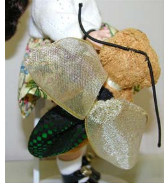
Close up of Fire-Fly Bear.